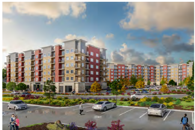
New Apartment Elevation